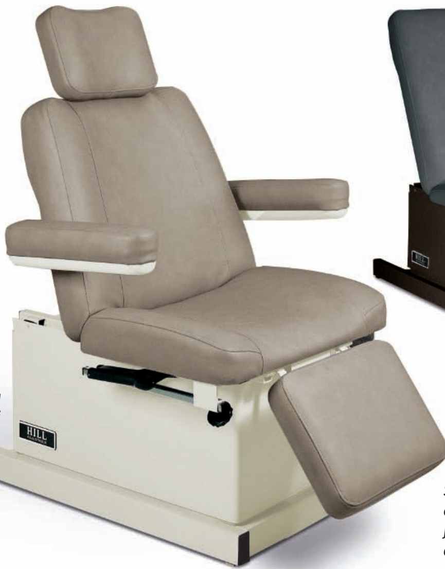
Shown with Gravel and Beige Base