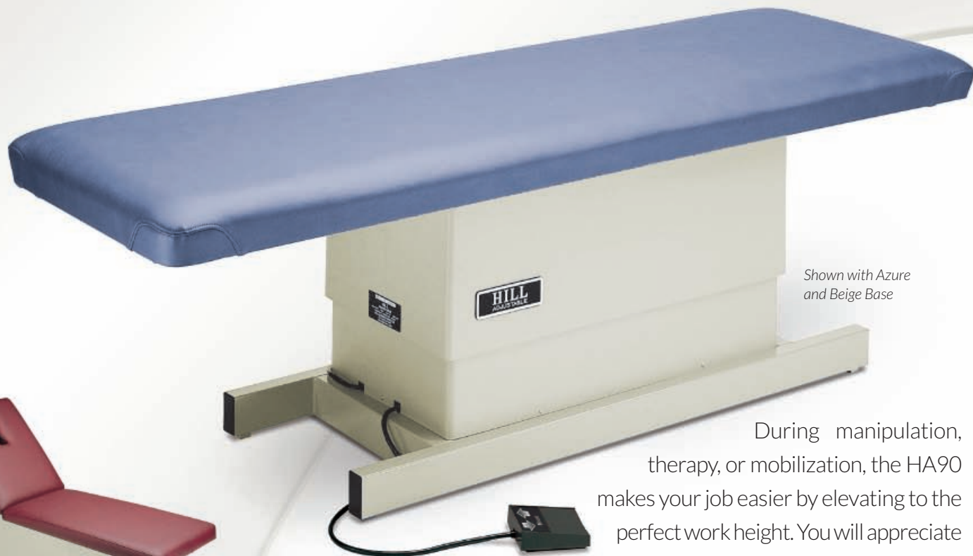
Shown with Azure and Beige Base

During manipulation, therapy, or mobilization, the HA90 makes your job easier by elevating to the perfect work height. You will appreciate the reduction in bending and back