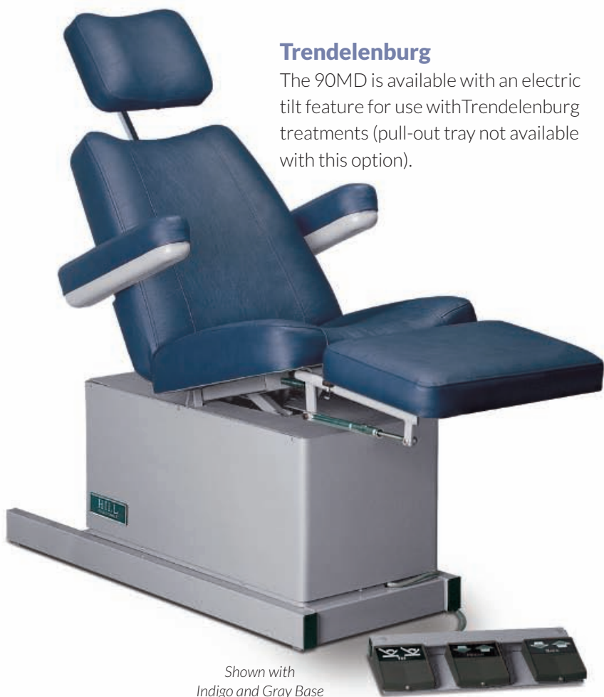
Shown with Indigo and Gray Base