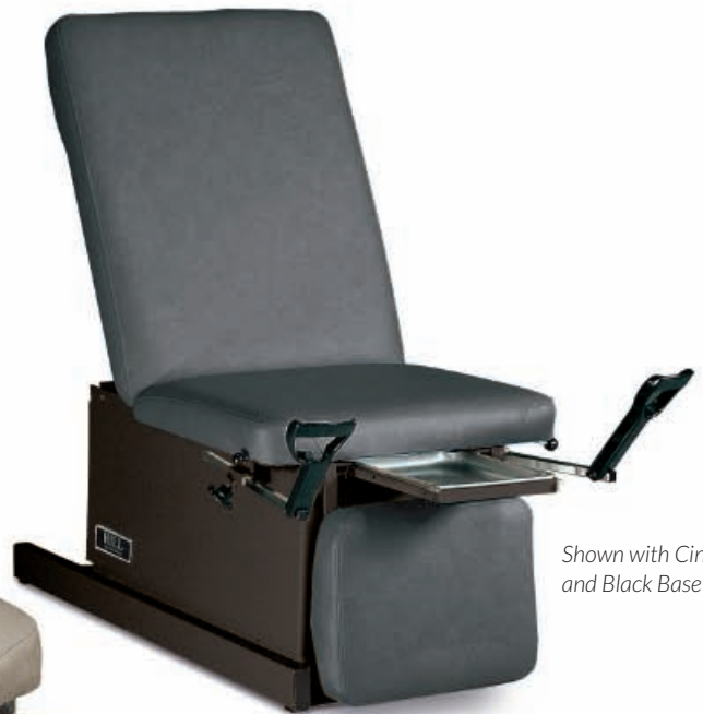
Shown with Cinder and Black Base