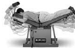
Repex Table McKenzie Technique