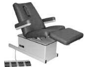
90W Wound Care Chair