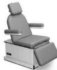
90D Dermatology Chair