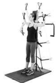
Posture Angel™ Active Rehab System