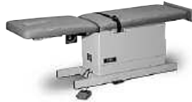
Rath Mechanical McKenzie Technique