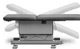
HA90V Tilt Vascular/Diagnostic