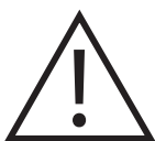
Attention Symbol consult accompanying documents

Symbols - Each of the symbols below are used in your product labeling. An explanation of each is below.