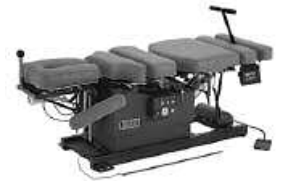
Air-Flex w/4 Drops