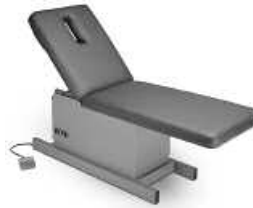
HA90 Lift Back