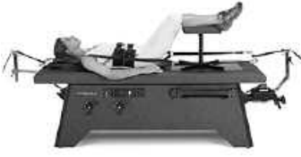
Anatomotor Massage w/Traction