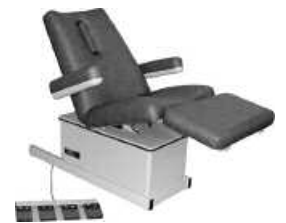
90W Wound Care Chair