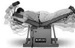
Repex Table McKenzie Technique