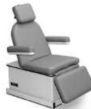
90D Dermatology Chair