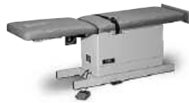
Rath Mechanical McKenzie Technique