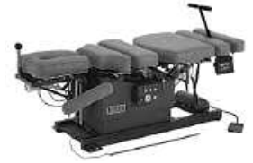
Air-Flex w/4 Drops