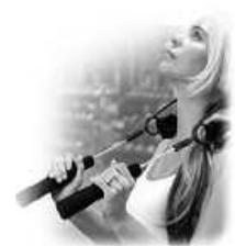
Neck Correct™ Cervical Spine Rehab